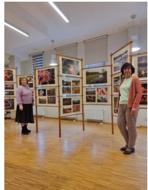
Photo exhibition "In the peatlands from -30°C to +30°C plants, animals and researchers"